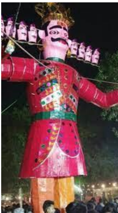
Picture 4: This is the effigy of Ravana displayed in Delhi Ramlila maidan before burning at the end of Dusserah festival where a central head is idealized and other nine heads are being attached with no justification of anatomy knowledge.