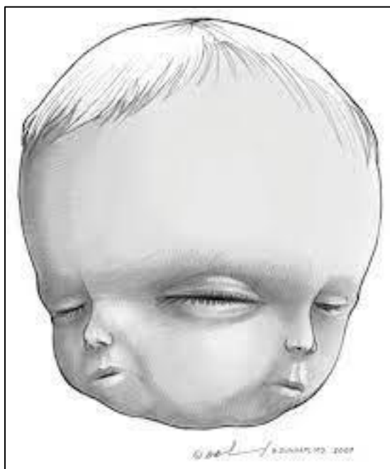
Picture 3: Rizzi and Durham 2013 have conceptualized an imaginary illustration