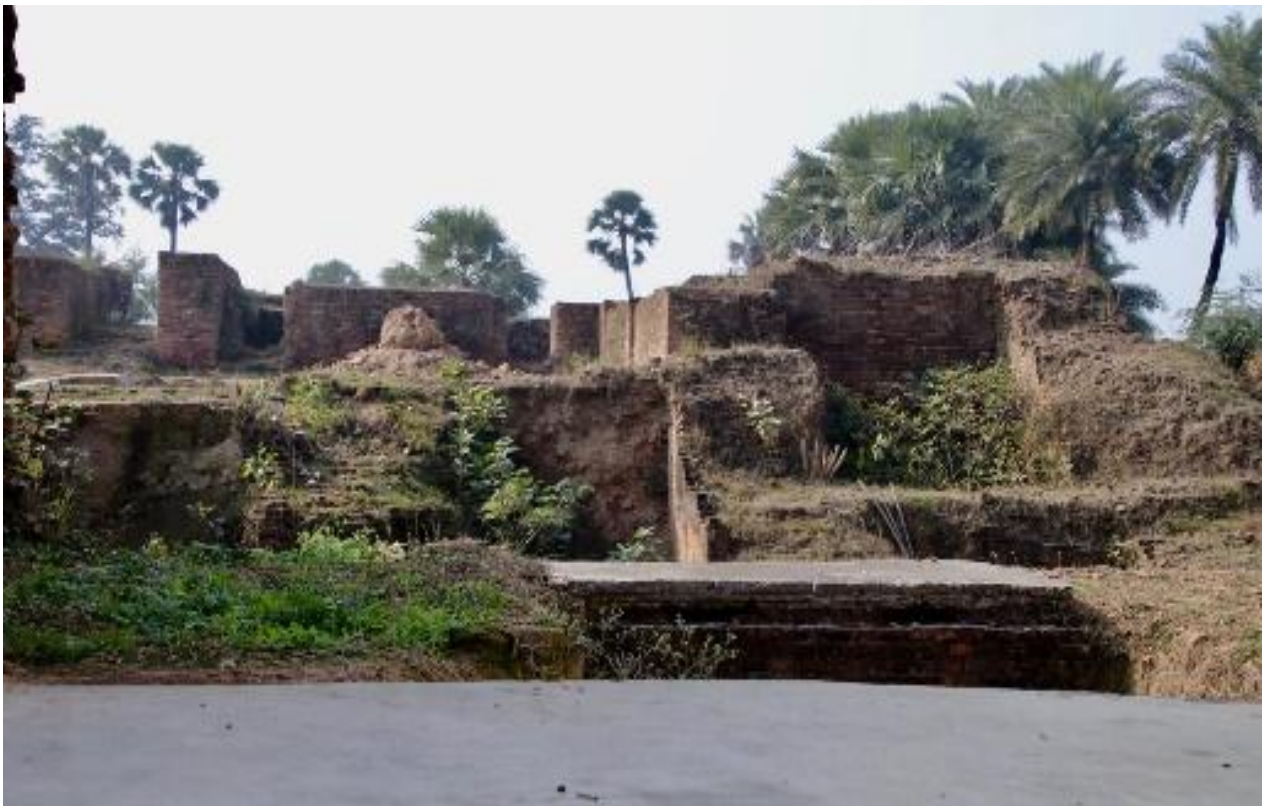
Telhara excavation site showing monastery remains.

So, the excavations revealed some unique features of Telhara University, such as its four-storeyed structure with monk cells, central courtyard, an advanced drainage system, prayer halls and furnished lecture rooms. The excavated area seems to be more than 30,000sq.m. The unique feature of the Telhara excavation is that, to date, Telhara is the only known ancient Indian university where evidence of a four-storeyed monastery has been discovered.