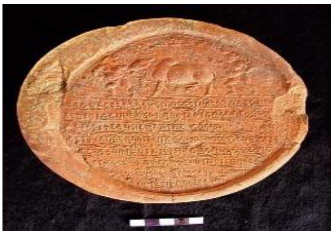
Terracotta seal with Dharmachakra motif.

The significance of this seal is that it confirms institutional organization, Demonstrates Buddhist monastic administration. It also indicates official university seal usage.